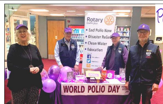
Dolphin Centre stall (£85 raised); crocus planting by Reid St. RotaKids

Please help to distribute either to individuals or in public places.