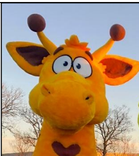
Fudge the Giraffe from GNCH